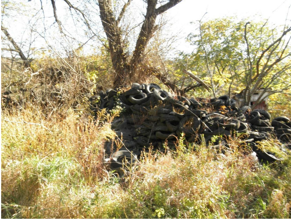
FRONT OF TIRE PILE BEHIND SHOP APPROXIMATE 5000 TIRES