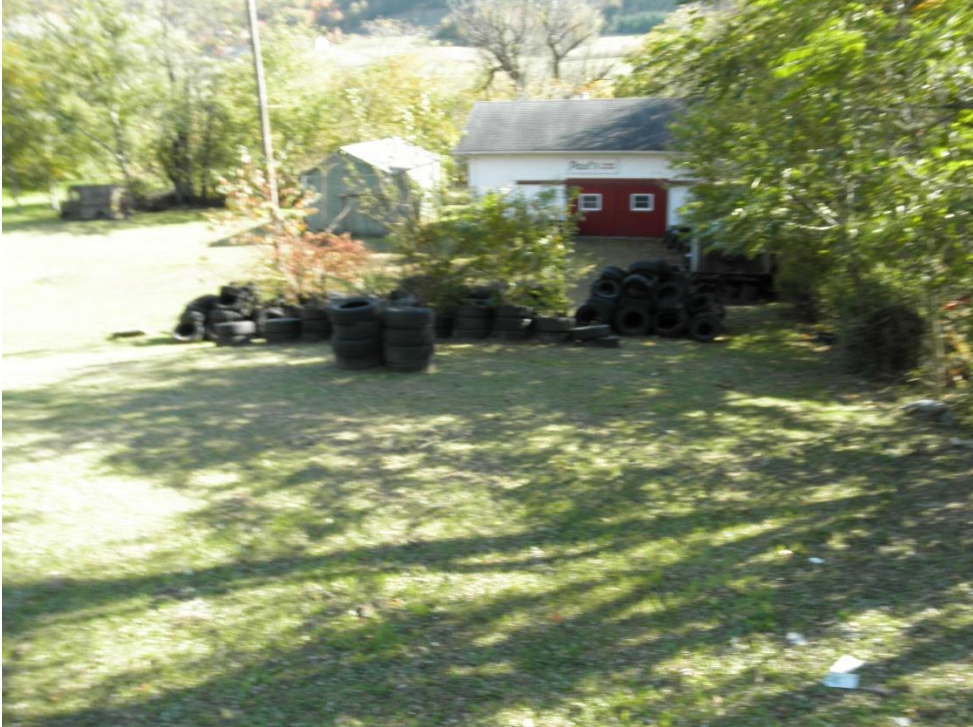
TIRE PILES IN FRONT OF SHOP