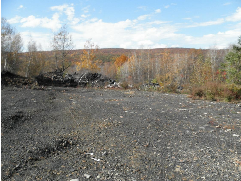
TIRE PILE PUSHED DOWN EMBANKMENT