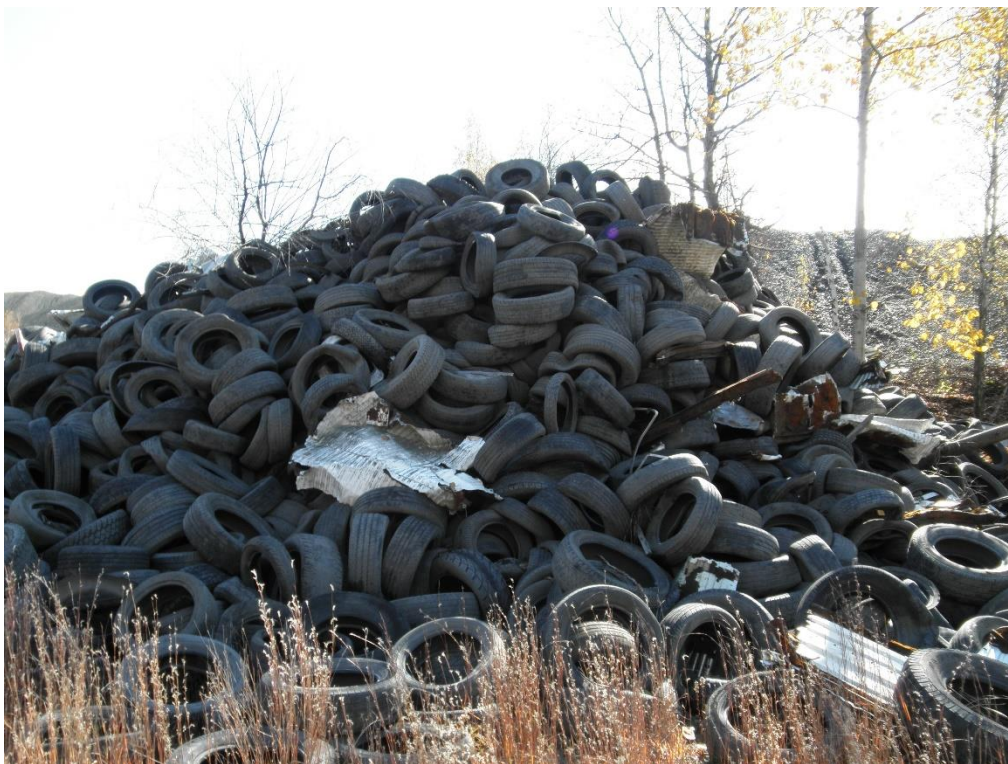
TIRE PILE FROM BOTTOM OF EMBANKMENT