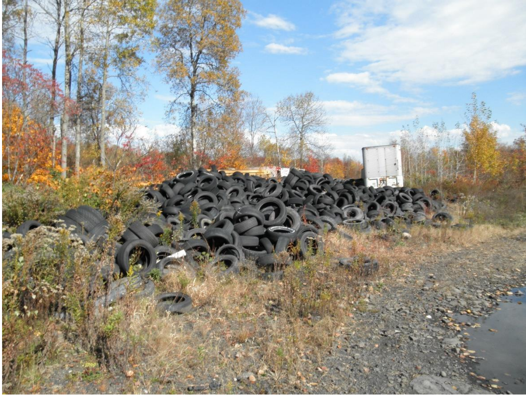
SAME LARGE TIRE PILE ON LEFT FROM A DIFFERENT DIRECTION