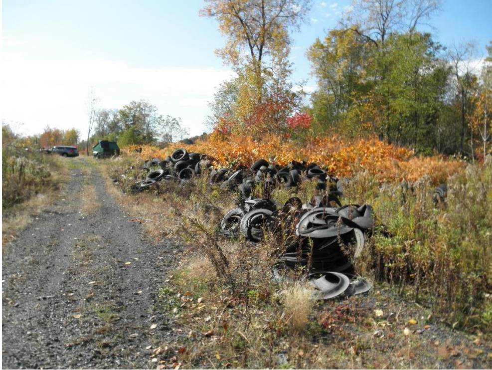
TIRE PILES ON THE LEFT