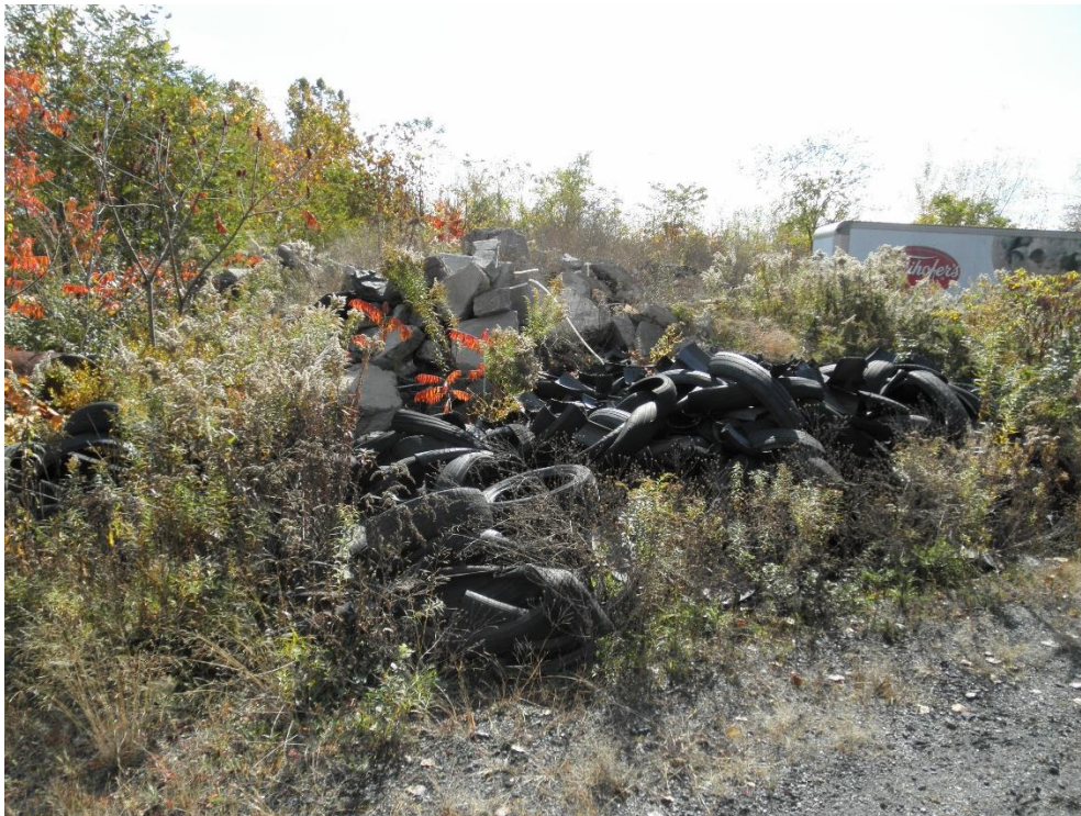
BERM OF TIRE FROM THE RIGHT SIDE WITH OVERGROWN BRUSH