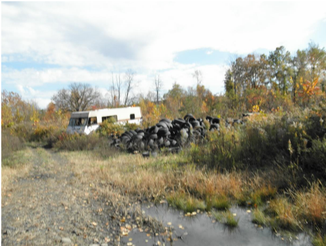
TIRE PILE ON RIGHT SIDE OF ROAD