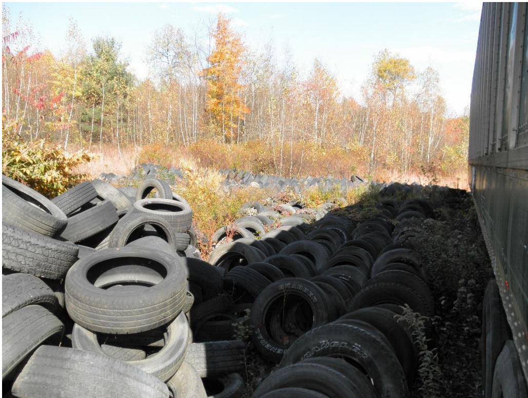
AREA OUTSIDE OF TRAILER #6