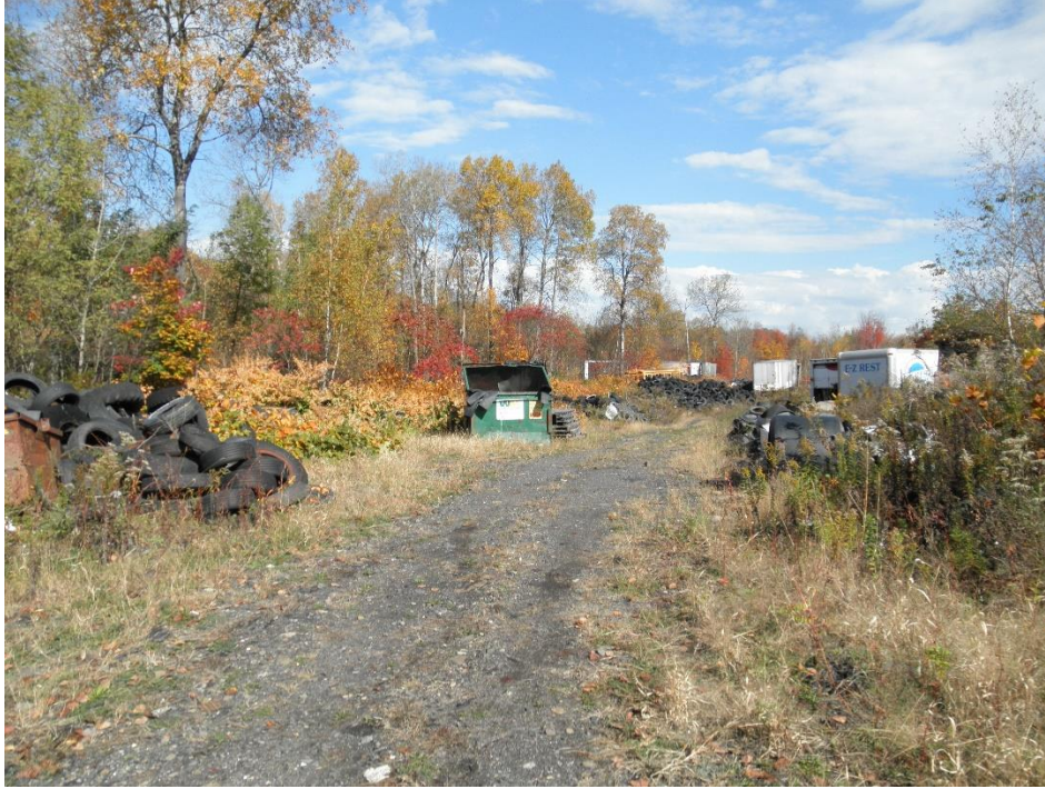
ENTRANCE OF THE TIRE PILE SITE PILES NOTED ON BOTH THE RIGHT, LEFT, AND FRONT