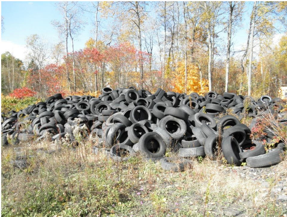
VERY LARGE TIRE PILE ON LEFT OF ROAD