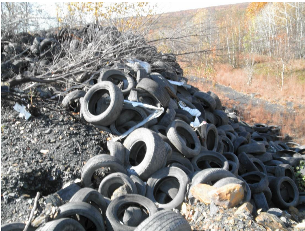
TIRE PILE FROM THE TOP OF EMBANKMENT