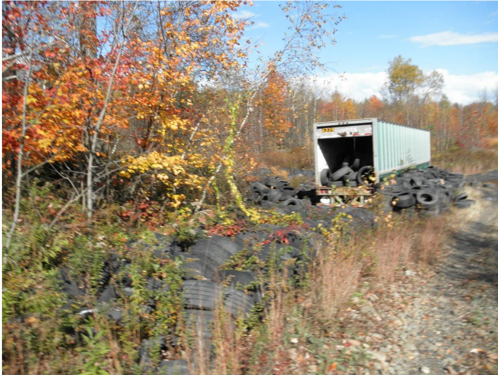
TRAILER #6" 53' TRACTOR TRAILER 100% FULL OF TIRES NOT LACED