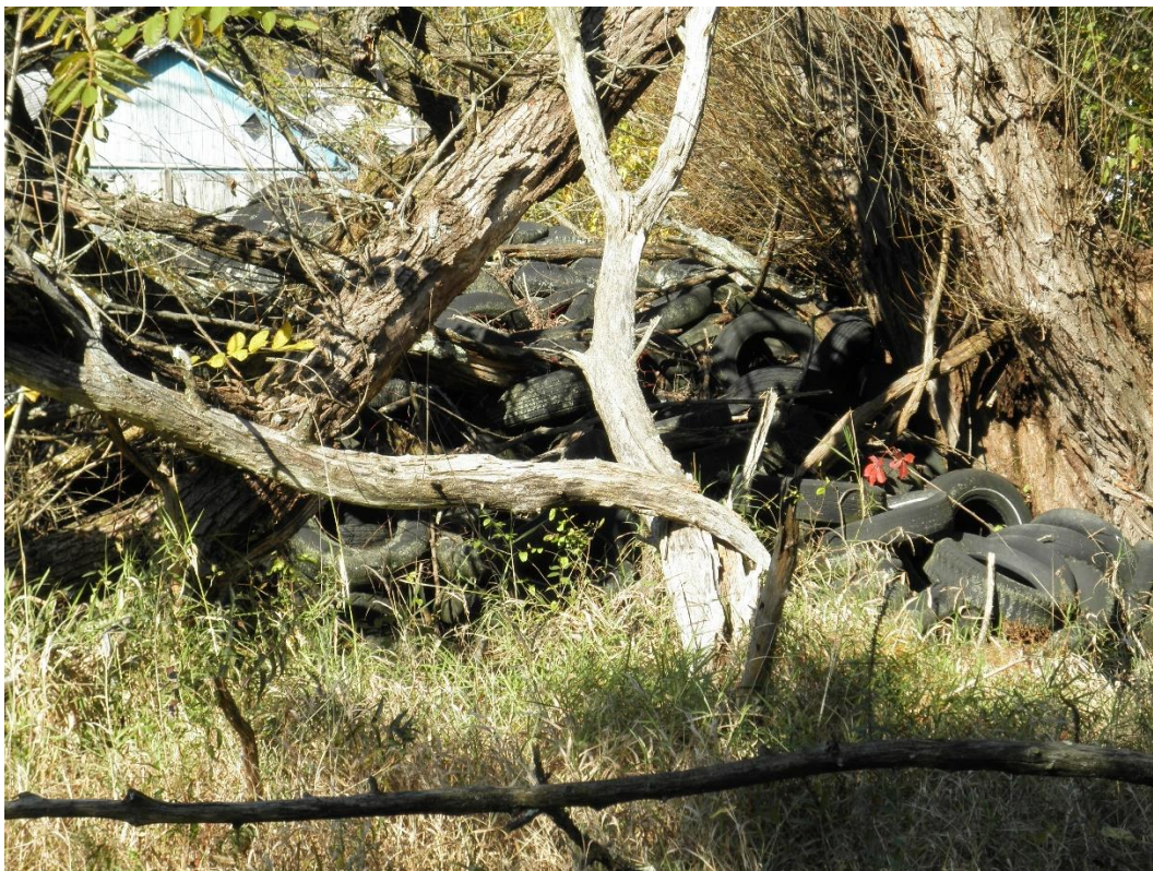
BACK VIEW OF TIRE PILE BEHIND SHOP 5000 TIRES