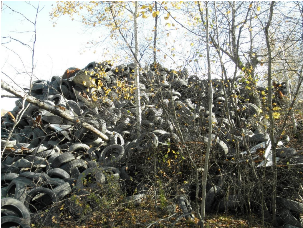
TIRE PILE FROM BOTTOM OF EMBANKMENT