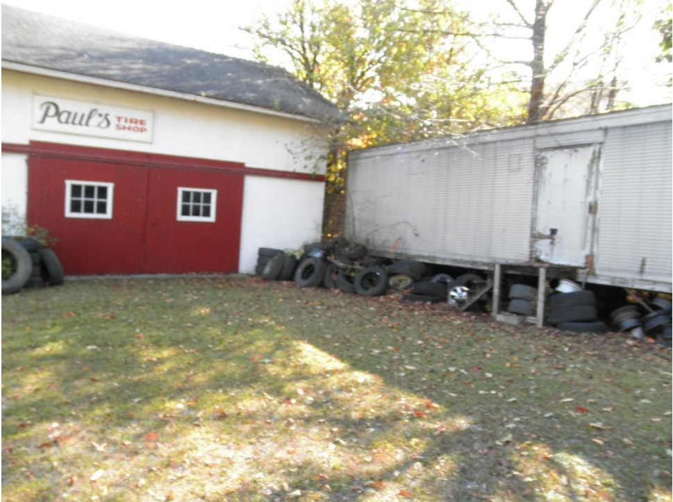
TIRES BY TRAILER