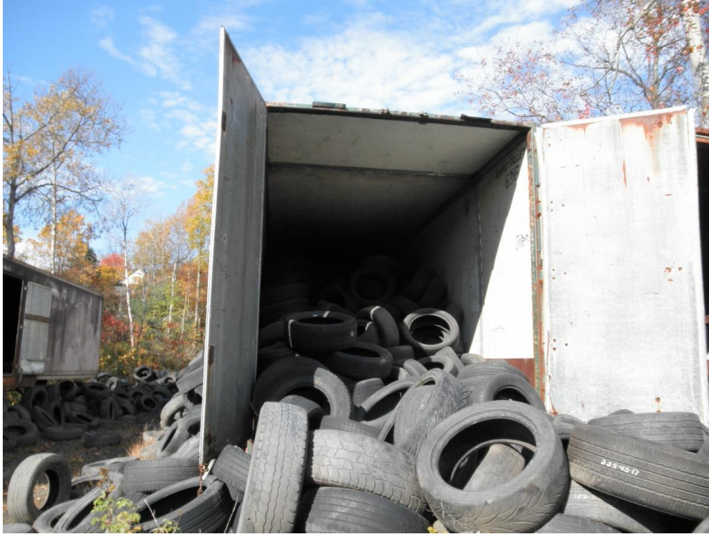
TRAILER #4: 53' TRACTOR TRAILER 40% FULL OF TIRES