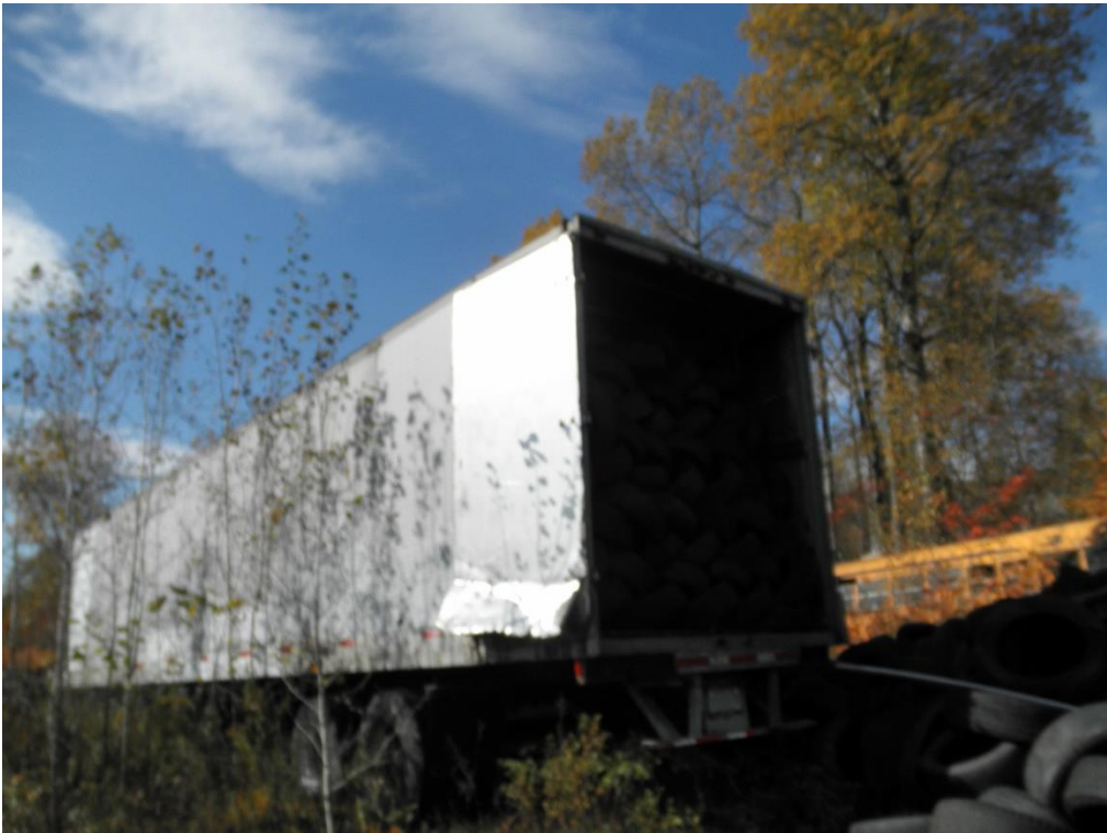
53' TRACTOR TRAILER 100% FULL OF TIRES LACED