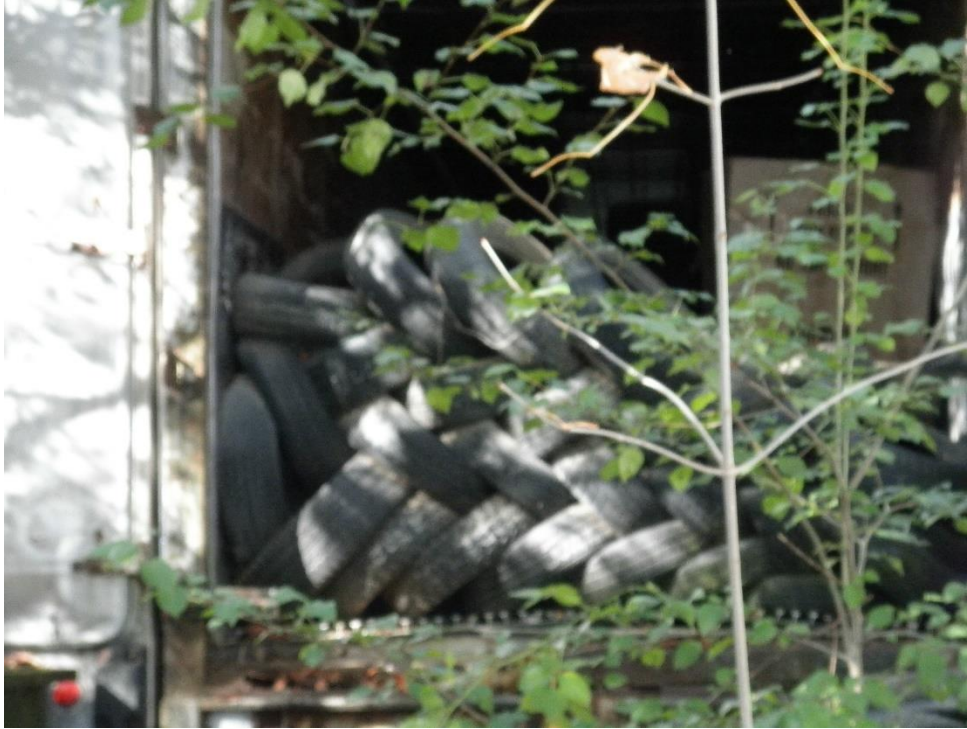
TIRES INSIDE THE SILVER TRAILER APROXIMATE 100 TIRES