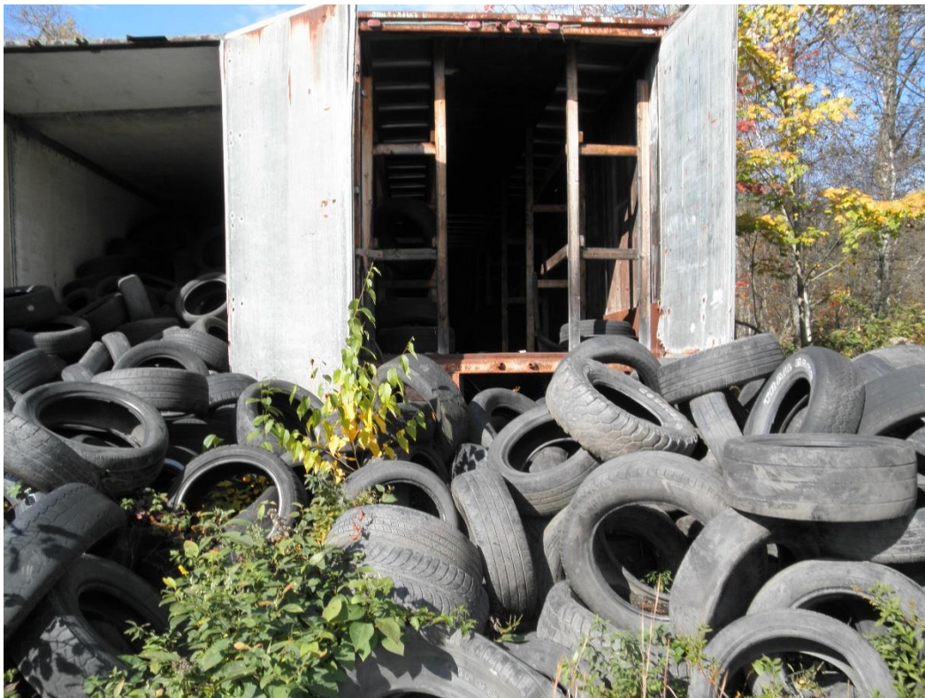
TRAILER #5: 53' TRACTOR TRAILER 10% FULL