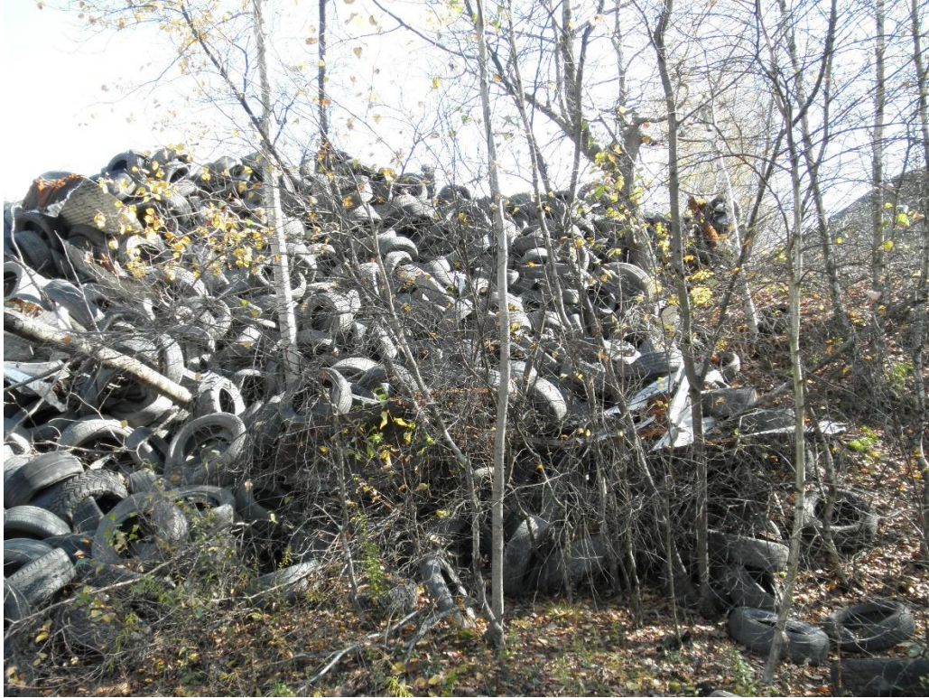
TIRE PILE FROM BOTTOM OF EMBANKMENT