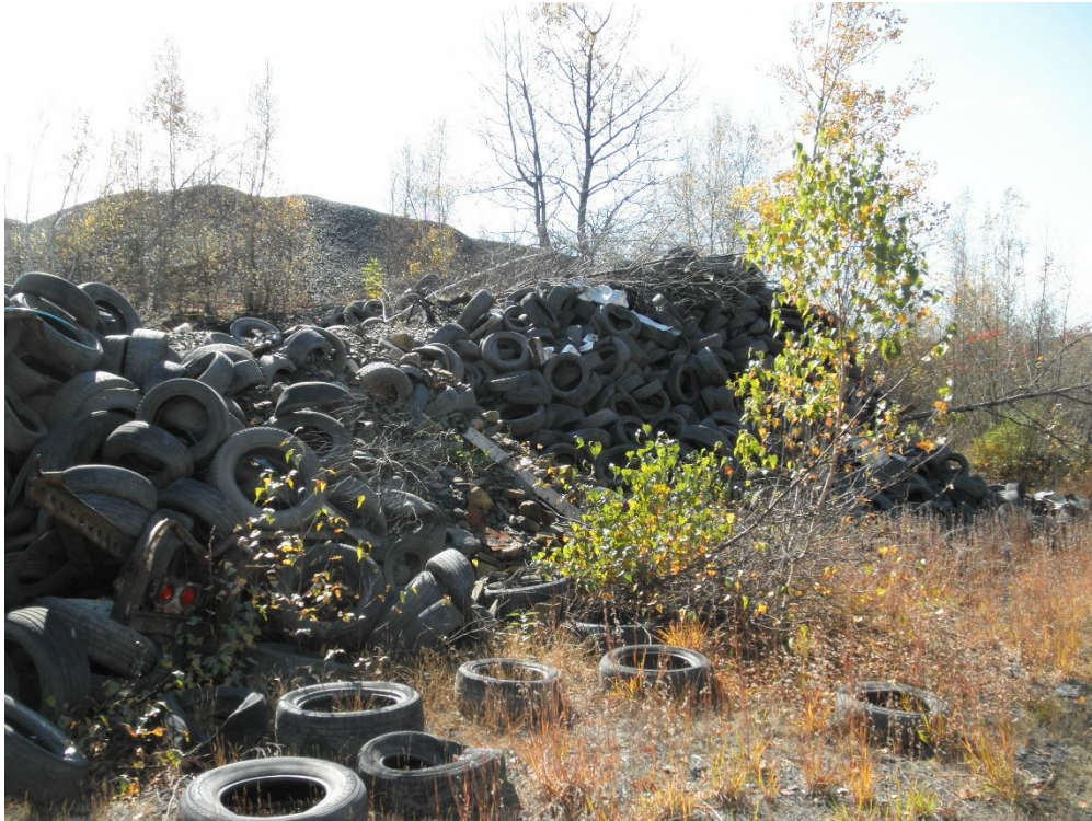
TIRE PILE FROM BELOW EMBANKMENT